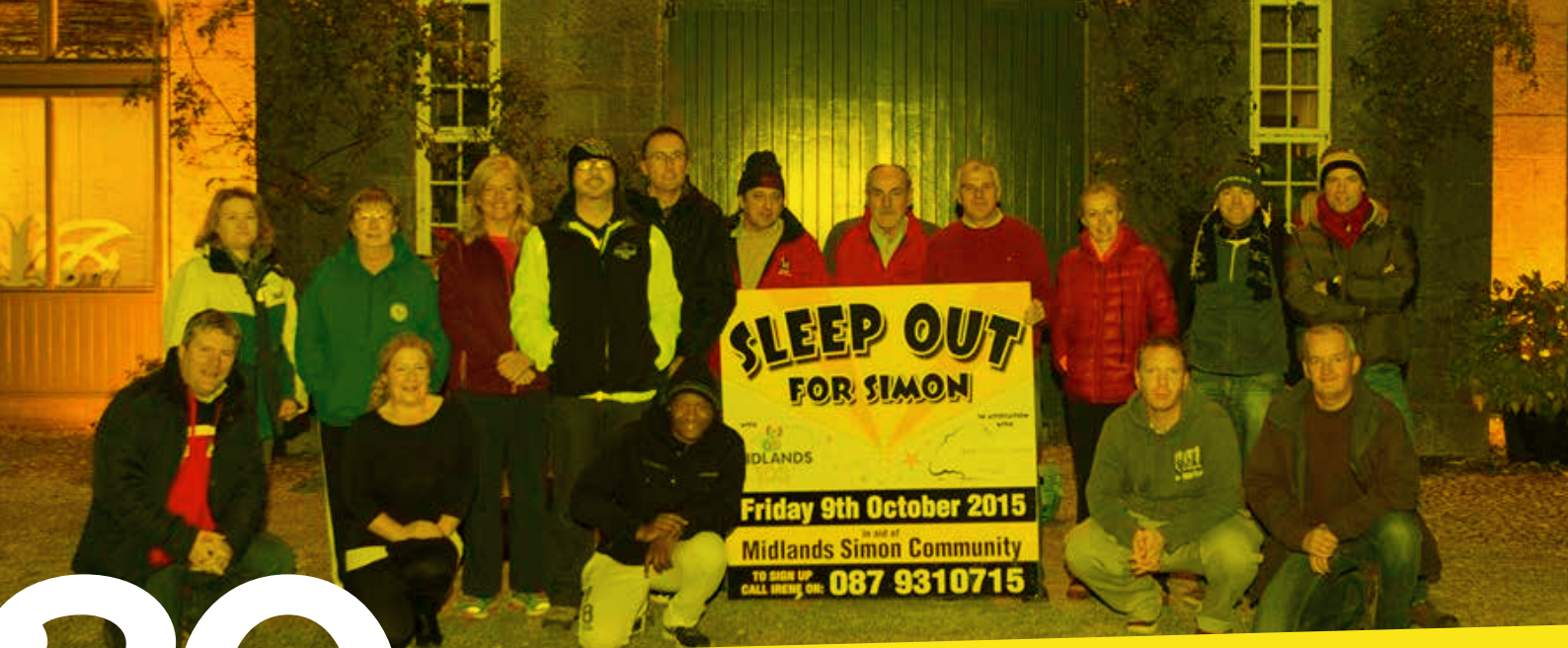
Participants at the Annual Sleep Out for Midlands Simon Community, held in Birr Castle, Co Offaly.